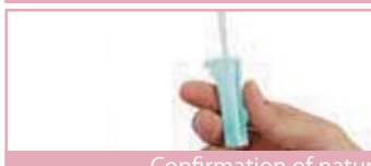
Confirmation of natural instillation