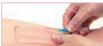
Puncture with IV cannula