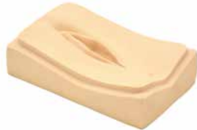
2 genitalia skin (perineorrhaphy)