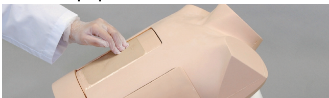
Identification of "Larrey's point" (left xiphisternal junction) for needle insertion